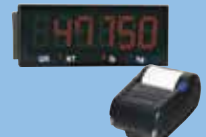
Displays & Printers