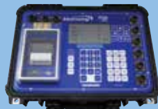
PT20™ Weighing CPU