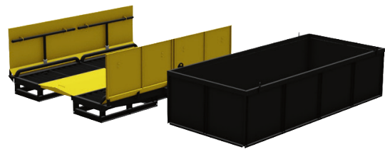
GX400 with 10m 3 water tank