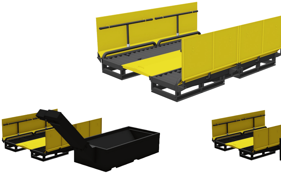
GX400 with Conveyor Tank

The AccuWash GX series are complete wheel wash systems with modular design that can be customised to suit a variety of site requirements, and an ideal solution for ensuring your operations are EPA compliant.