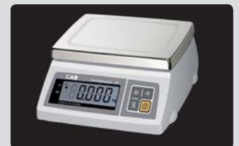
Stainless steel platter