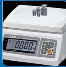
Dual interval technology