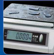
Rear display option