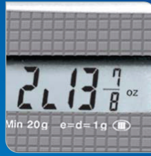
Unit Conversion: lb, oz